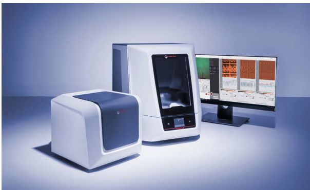
Tosca™ analysis software for Tosca™ 400 AFM

Specially designed for industrial users, the Tosca™ 400 comes with Tosca™ Control software for operating the AFM. Add to that new Tosca™ analysis software and users now have a complete solution for complex nano-surface analysis in a wide variety of application areas including characterization of semiconductor properties and investigation of polymer chains.